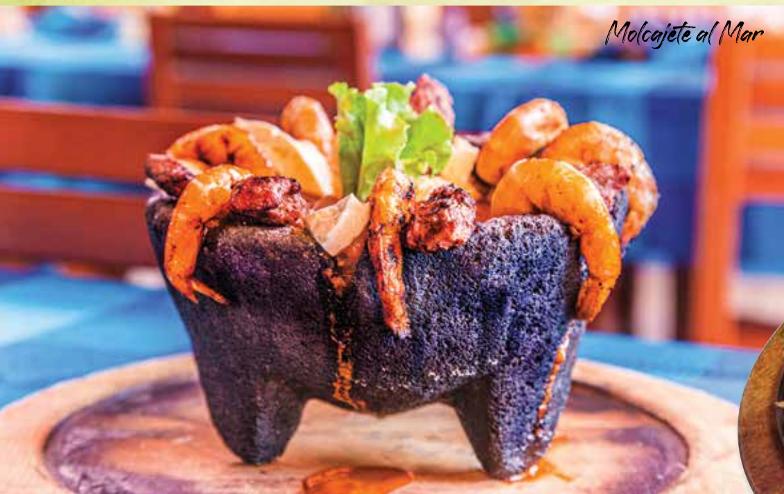
Molcajete al Mar

Grilled chicken or steak mixed with chorizo, pineapple, vegetables, cilantro, onions, cheese, served with rice beans guaca salad, sour cream and tortillas. 15.99 Texana 17.99