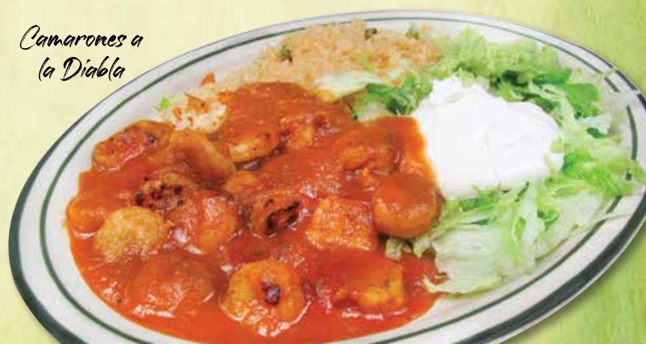
Camarones a la Diabla

Grilled chicken breast, with grilled onions, served with rice, guacamole, pico de gallo and tortillas. 13.55