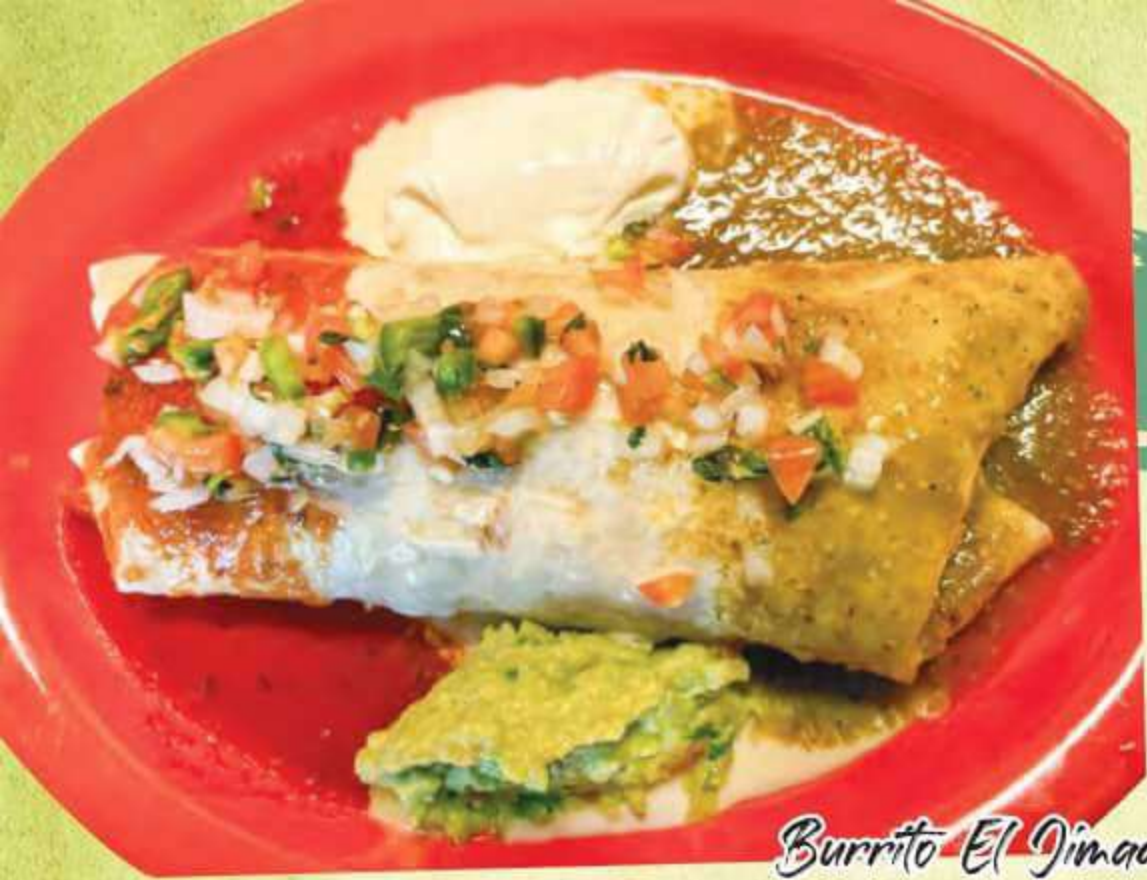
Burrito El Jimador